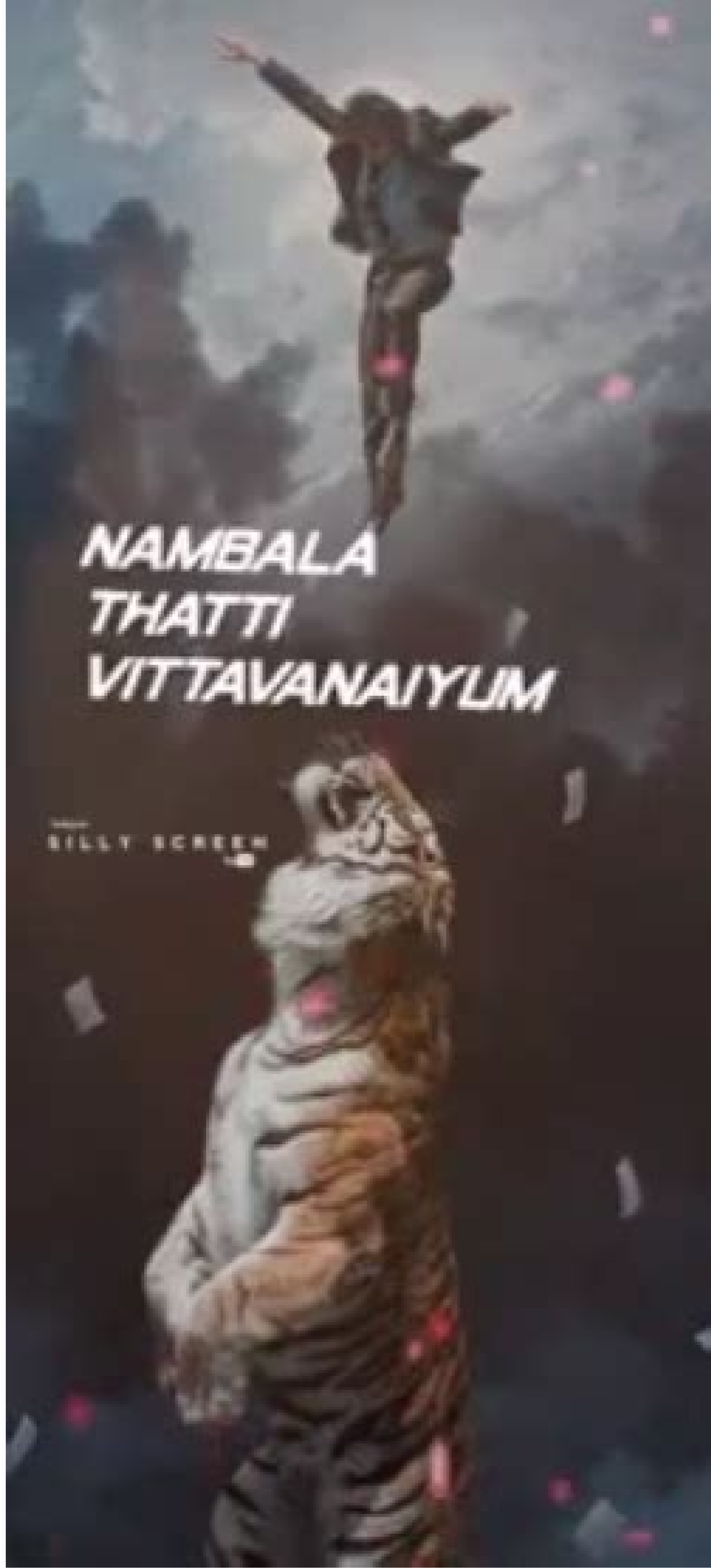
Bekhayali whatsapp status video free download.